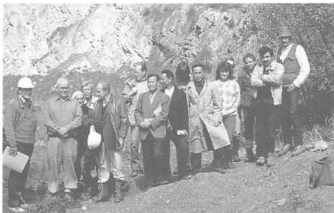
Figure 4: The ICS Working Group on the Precambrian-Cambrian Boundary in front of a quarry face exposing the Lower Cambrian Wrekin Quartzite near Telford, Salop, England.