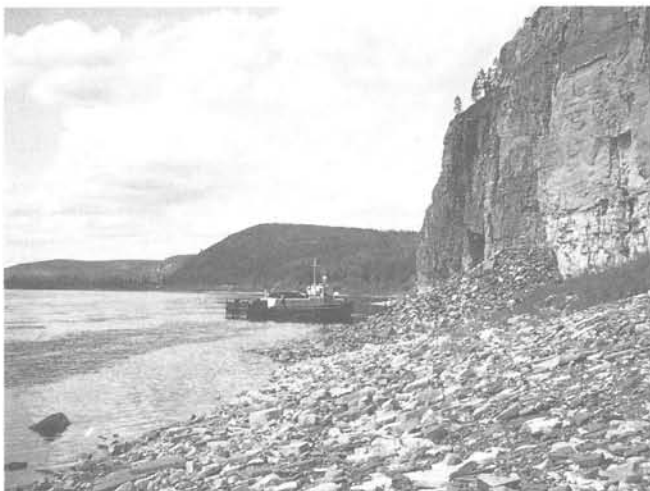
Figure 3: The Aldan River section at Ulakhan-Sulugur, Yakutia, eastern Siberia, U.S.S.R. Another global candidate for the Precambrian-Cambrian stratotype.

As regards the Devonian stage boundaries, SDS decided in 1983 that the classic Lower Devonian areas (Gedinnian, Siegenian and Emsian) were not suitable for revision of stratigraphic boundaries and for correlation on a global