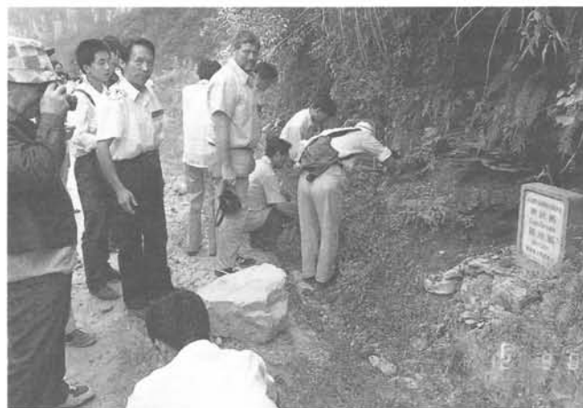
Figure 2: Studying the Sinian-Cambrian boundary in the Yangtze Gorge region near Yichang, Hubei, China.

northern Pakistan, to the Alburz Mountains in Iran. Similar lithological and microfossil successions in this belt suggest that they were adjacent blocks on the northern margin of early Gondwanaland.