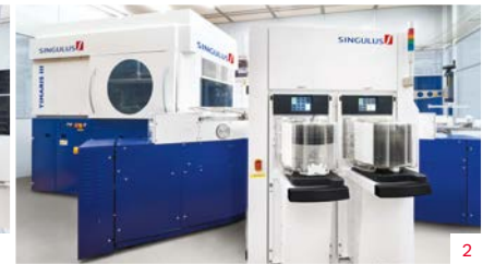
2: TIMARIS III production system for the manufacturing of 300 mm wafer