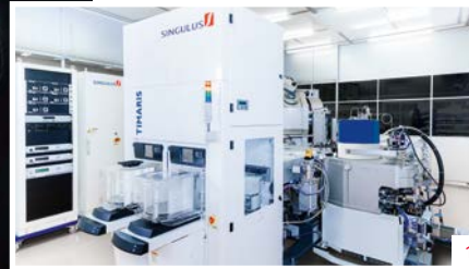
1: TIMARIS II ultra-high vacuum deposition system