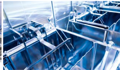
2: Cleaning and deposition of medical products