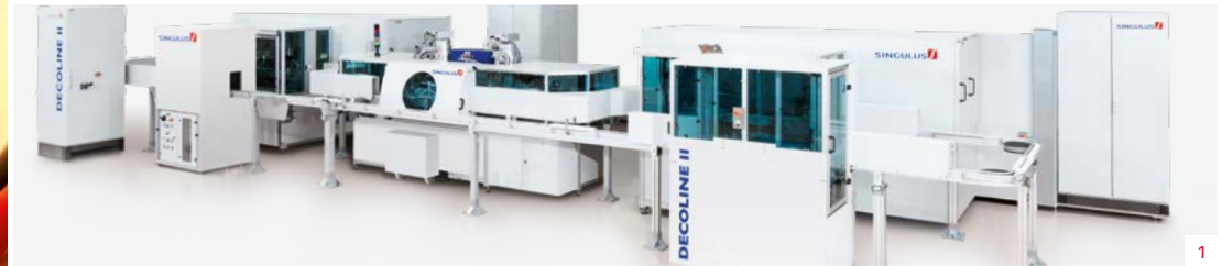
1: DECOLINE II inline production system for 3D parts

Whether in the cosmetics or automotive sectors, metallic quality surfaces are needed more than ever for 3D coatings for decorative purposes. A wide range of enhanced metallic layers on 3D parts for cosmetics, automotive, bottle caps for the eco-friendly and chrome (VI)-free refining of 3D parts are available. SINGULUS TECHNOLOGIES offers the second generation of inline coating solutions for fully automated handling and coating of 3-dimensional parts. From loading to packaging, the process is fully automated and not one manual step is necessary – at a cycle time of only 0.4 seconds per component. In the shape of the new DECOLINE II SINGULUS TECHNOLOGIES is able to offer the industry an environmentally friendly process and significant benefits for simplifying their production processes.