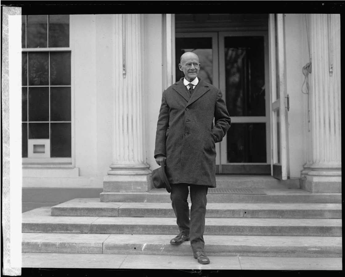
Eugene V. Debs leaves the White House, on his way home from prison.

' I he crisis Americans are in today is at least as severe as the one back then, but in different ways. Although ominous conflicts exist abroad, the United States is not itself at war, and we are spared the hysteria that can come with that. And we do have a vocal, outspoken opposition, armed with means of instant communication unimaginable during World War I. But we also have a president who has let convicted vigilantes out of jail , who shutters agencies lawfully established by Congress , who defies judges' rulings and who sounds fiercely determined to humiliate , jail or deport his enemies. What are the lessons for us today of that sorry time a hundred years ago?