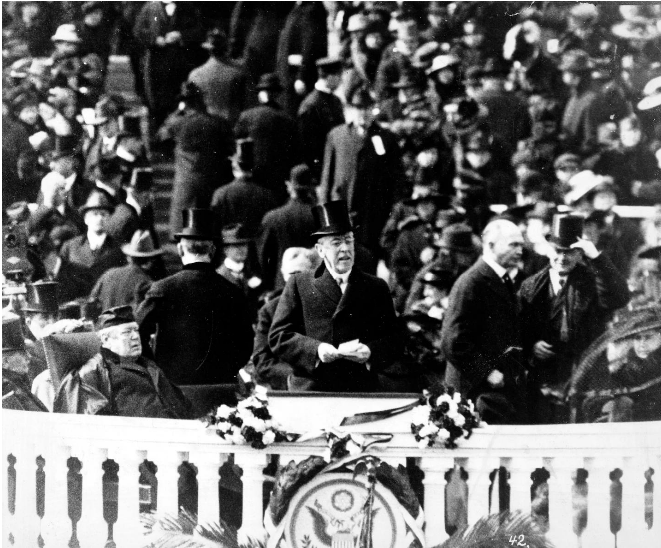
Woodrow Wilson's second inauguration, March 4, 1917.

Just over a century ago, a major war, fear of foreign subversion and an administration with little respect for civil liberties unleashed several years of the worst repression in the United States since the immediate aftermath of slavery. What is unfolding in the country today is different in many ways, but this earlier period holds lessons for us about how swiftly the government can take away basic freedoms — and about our need to be vigilant to be sure it doesn't happen again.