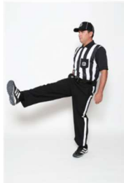
ROUGHING THE KICKER kicking motion