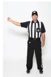
UNNECESSARY ROUGHNESS pumping motion of arms sideways