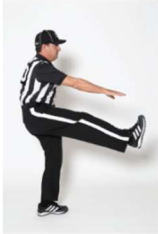
CONTACTING THE KICKER touch raised leg below knee