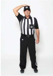
ILLEGAL SUBSTITUTION one hand on top of head