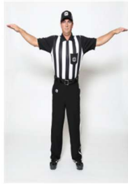
INELIGIBLE RECEIVER both arms extended sideways