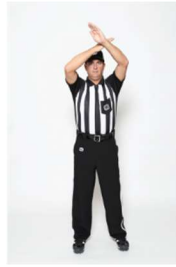
SPEARING chopping motion above head