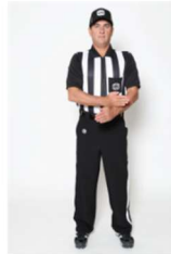
DISQUALIFICATION chopping action on wrist