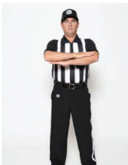
NO YARDS arms folded at chest