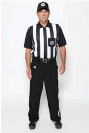
ILLEGAL CRACKBACK striking thigh with open hand