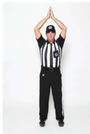
SAFETY TOUCH palms together above head