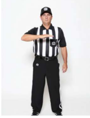
ILLEGAL PASS horizontal arc of arm