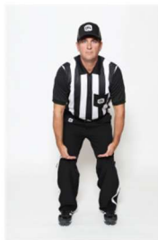
TRIPPING chopping action on both knees