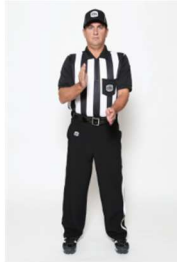
PILING ON vertical chopping motion with both hands