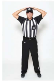
TOO MANY PLAYERS both hands on top of head