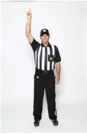
SINGLE POINT one arm extended above head & indicating 1 point