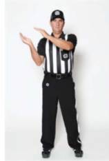
CUT OR CHOP BLOCK horizontal chopping motion