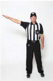
TIME COUNT VIOLATION arm extended moving in circular motion