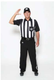
ROUGHING THE PASSER passing motion