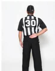
OBJECTIONABLE CONDUCT One hand behind back