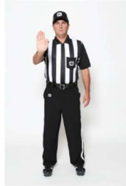
ILLEGAL CONTACT ON A RECEIVER one arm extended with open hand