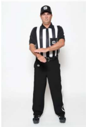
RESETTING THE 20 - SECOND CLOCK a stroking motion of the forearm