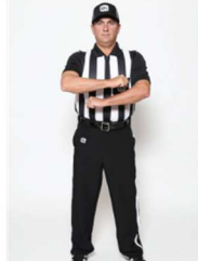
ILLEGAL PROCEDURE hands rotating in forward motion