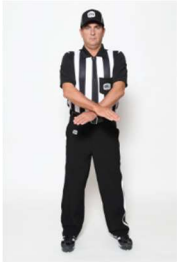
PENALTY DECLINED swinging arms at hip level