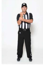
HOLDING grasping wrist at chest level