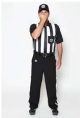
FACEMASK clenched fist at face level