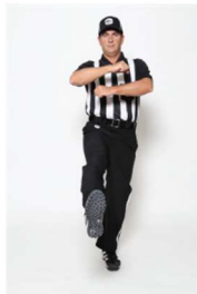
ILLEGAL KICKOFF hands rolling in forward motion followed by swinging leg