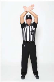
TIME OUT hands crossed above head