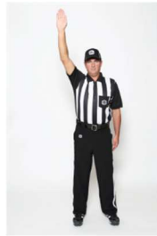
TIME IN downward rotation of arm