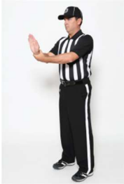
ILLEGAL BLOCK arm extended & grasp wrist