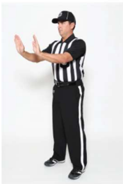
ILLEGAL INTERFERENCE pushing arms forward from shoulders