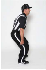
CLIPPING striking back of knees