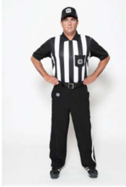
OFFSIDE hands on hips