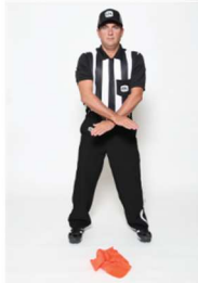
NO FLAG ON PLAY drop flag on ground & swing arms at hip level