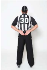
DELAY OF GAME both hands behind back