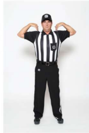
ILLEGALLY DOWNFIELD ON A KICK both hands on top of shoulders