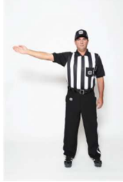
ONSIDE OR LATERAL PASS pointing in the direction the ball was thrown