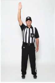
FORWARD PASS BEHIND LINE OF SCRIMMAGE raise arm above head