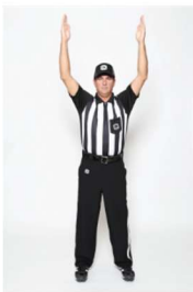
TOUCHDOWN OR FIELD GOAL both arms raised towards sky