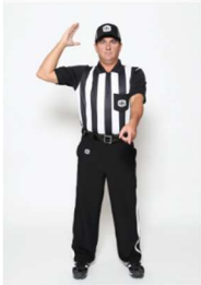
INTENTIONAL GROUNDING passing motion & pointing at ground