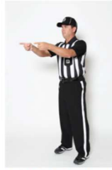
COIN TOSS WINNER pointing with both arms towards the team that won the toss